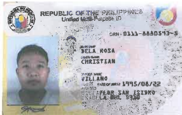
Photo of Proof of Identity attached